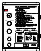
CONTROL BOX SCALE = 2X

ALL DIMENSION AND SPECIFICATIONS ARE FOR REFERENCE ONLY, ACTUAL DIMENSIONS AND PERFORMANCE CHARACTERISTICS MAY VARY.