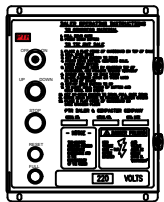
CONTROL BOX SCALE = 2X

ALL DIMENSION AND SPECIFICATIONS ARE FOR REFERENCE ONLY, ACTUAL DIMENSIONS AND PERFORMANCE CHARACTERISTICS MAY VARY.